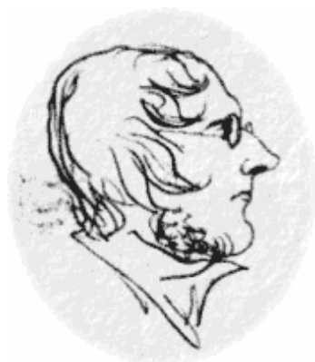
Self-portrait, 1840.