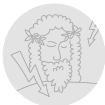
Steven Moffat , b. 1961 (Screenwriter, Scriptwriter)

Steven Moffat (1961- ) is an acclaimed Scottish TV writer and producer, who has been a significant force in British television and film since the late 1980s. Having studied at the University of Glasgow, he began writing creatively for the stage while working as a teacher in Greenock (near Glasgow). A play - War Zones (1985) - and a musical - Knifer (1989) - garnered some acclaim, but his big break came with a sample script for a show about a school newspaper. This was picked-up by ITV as Press Gang (1989-1993), showcasing much of Britain's up-and-coming young talent. From there, he worked on the series Joking Apart (1993-1995) and Chalk (1997), before having a huge hit with the relationship-themed comedy Coupling (2000-2004). Moffat was a long-time fan of Doctor Who - writing a comedy spoof for Comic Relief entitled The Curse of Fatal Death (1999) - and when it was relaunched under Russel T. Davies from 2005, he contributed scripts for perhaps the best episodes of the revamped series: The Empty