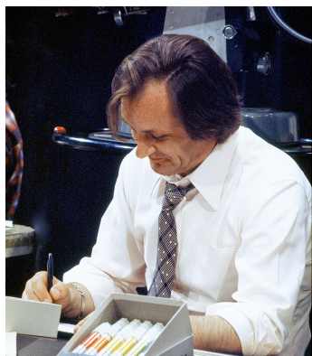
Albert Uderzo in 1973.

Retrieved from Wikimedia Commons , licensed under CC BY-SA 4.0 (accessed: December 30, 2021).