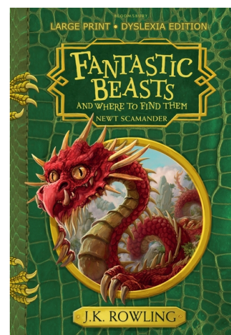
Covers from 2001, 2009, 2017 editions.