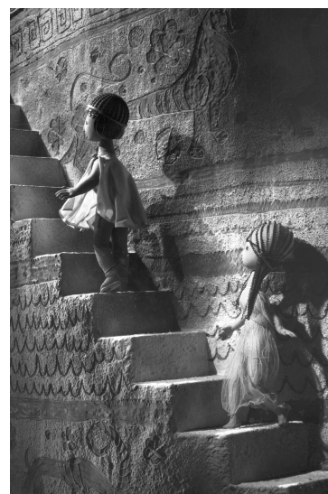
Frame from the animation.