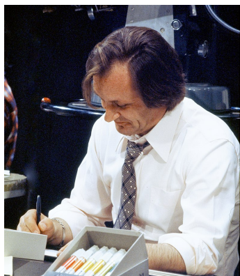
Albert Uderzo in 1973.

Retrieved from Wikimedia Commons , licensed under CC BY-SA 4.0 (accessed: December 30, 2021).