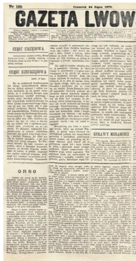
Gazeta Lwowska, Jagiellońska Biblioteka Cyfrowa, public domain.