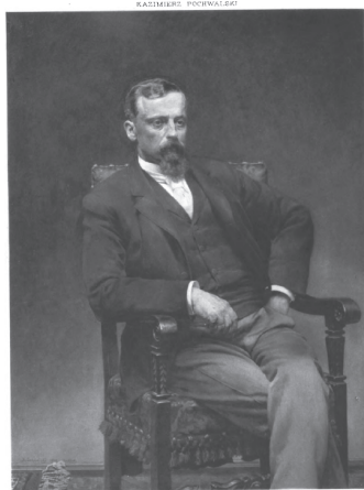
Painting of Henryk Sienkiewicz by Kazimierz Pochwański (1855–1940), retrieved from Wikimedia Commons.